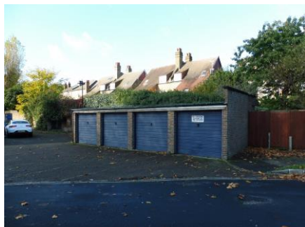
Photo of the front elevation.