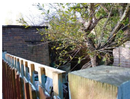
Structure belonging to 22A Grosvenor Road (left).